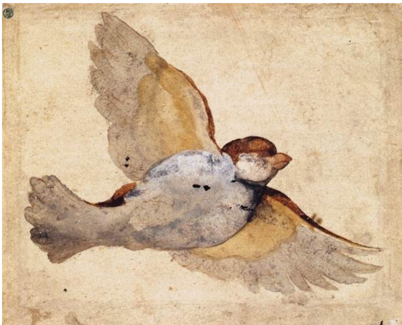
Study of a flying sparrow - Giovanni da Udine (1487-1564)

Those who find their life will lose it, and those who lose their life for Jesus' sake will find it. Matthew 10: 39