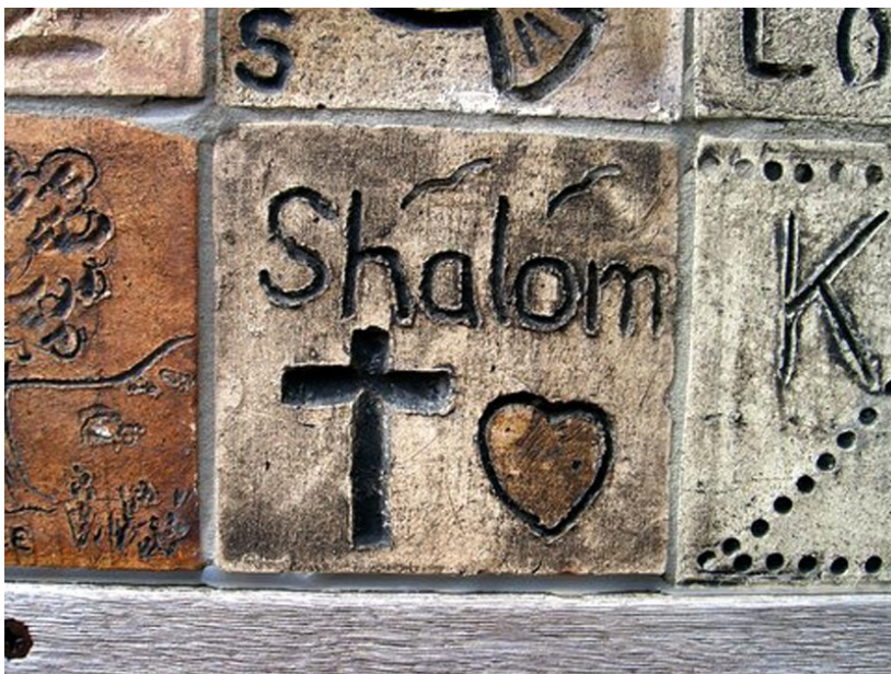
Tile from Peace Wall in Hamilton, NZ (20 th Century Mural)

Te whare karakia matua o Pita Tapu ki Waikato stpeter.org.nz