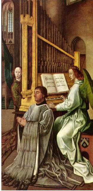
Trinity (ca. 1480) – Hugo van der Goes (ca. 1435-1482)

Proclaim the Name: ‘The Lord, the Lord, a God who is merciful and gracious, slow to anger and abounding in steadfast love and faithfulness.