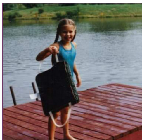
A young Blythe enjoying summer