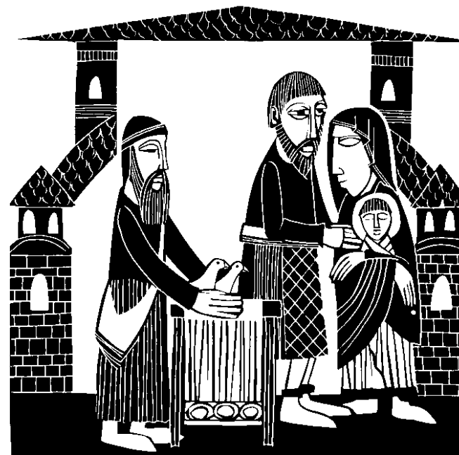
Presentation of Jesus in the Temple

Please take this Pew Sheet home with you and pass it on to others.