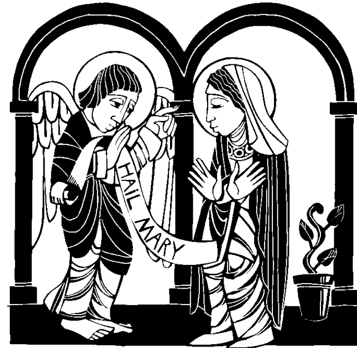
The Angel Gabriel greets Mary

A wheelchair, walker and baby changing facilities are available: please ask.