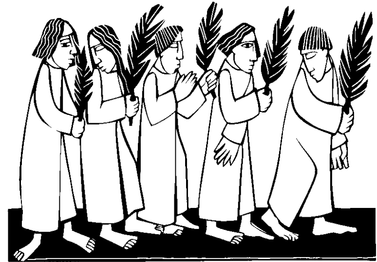
Procession of Saints

A wheelchair, walker and baby changing facilities are available: please ask.