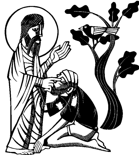
Jesus heals blind Bartimaeus

A wheelchair, walker and baby changing facilities are available: please ask.