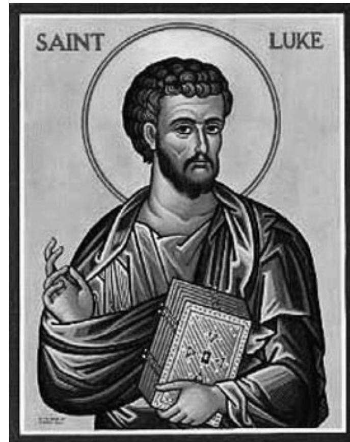
St Luke the Evangelist

A wheelchair, walker and baby changing facilities are available: please ask.