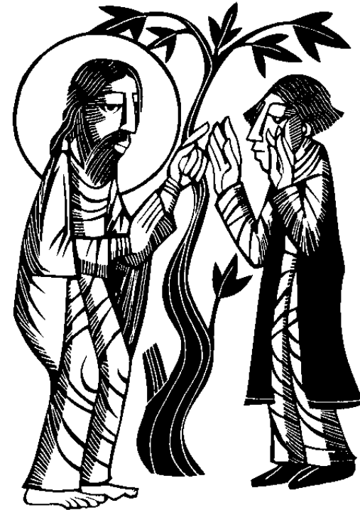
Jesus and the rich young man.

A wheelchair, walker and baby changing facilities are available: please ask.