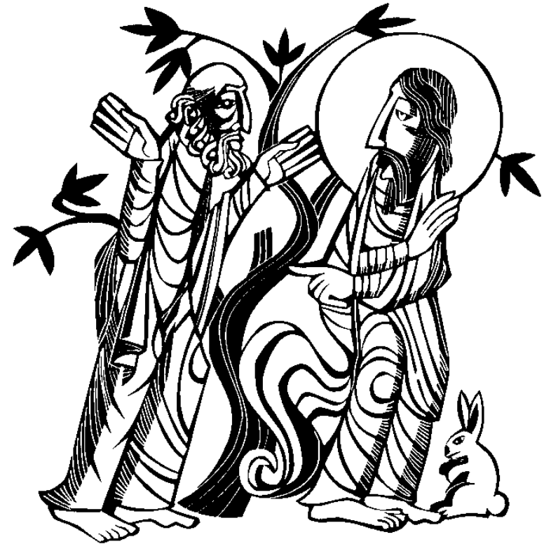
Jesus and Peter

A wheelchair, walker and baby changing facilities are available: please ask.